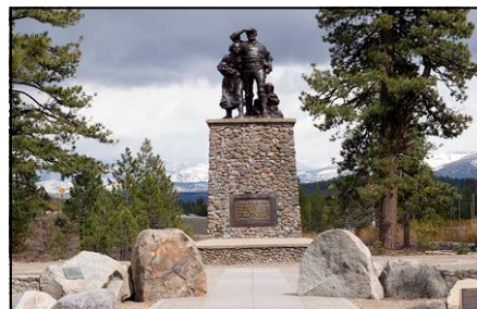
The base to the memorial is 22 feet high, equal to the total snowfall during the winter of the Donner Party's travails.

popular mind the chief fact to be remembered about the Donner Party.